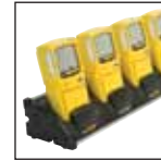
Multi-unit cradle charger