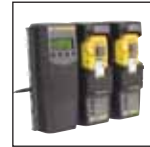
MicroDock II compatible