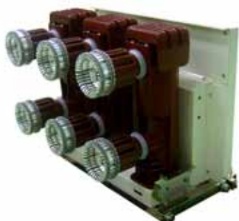
HVX 12 kV circuit breaker with embedded poles